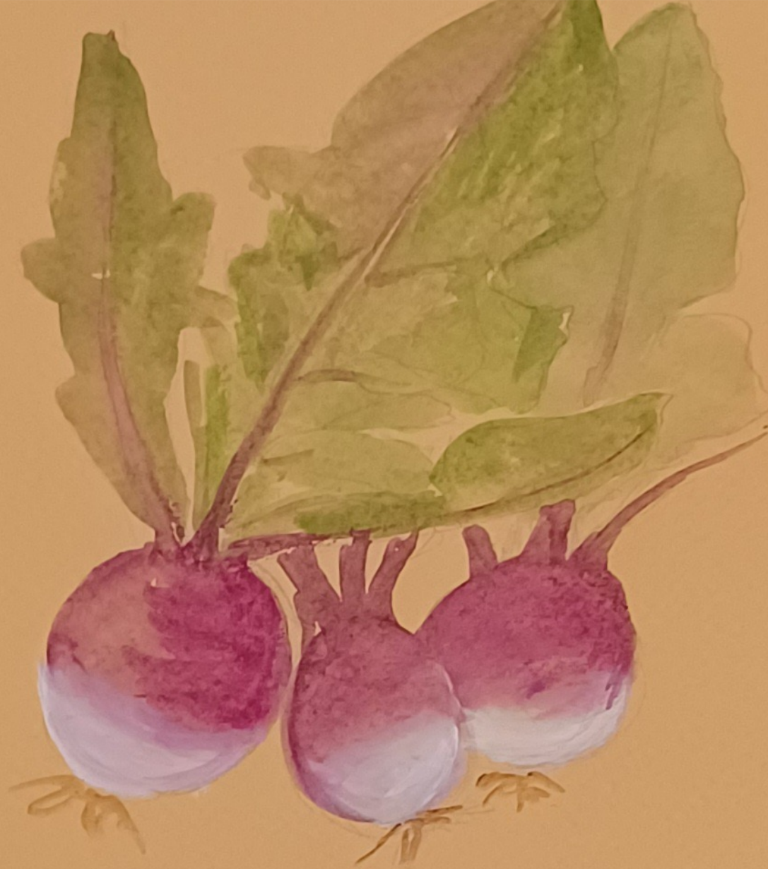
Possible detail on face of seat

Each seat will be carved on two sides with motifs also reflective of the Bartholomews business – for example, turnip (one of many forage crops), sunflowers (part of the range of gamecover crops), wheat or barley (part of the core seed range) to name but three possible options.