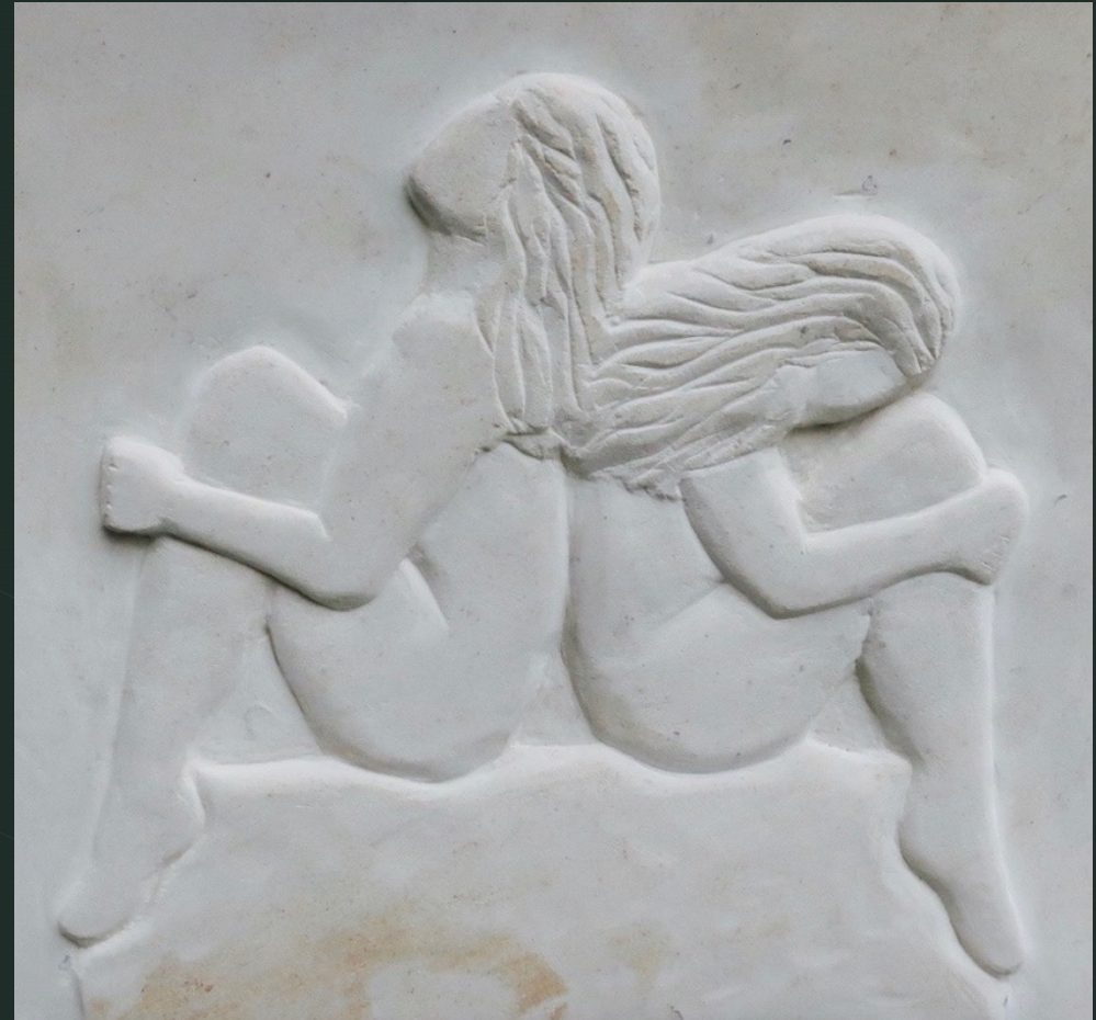
She & Her – Relief carving in Ancaster Stone