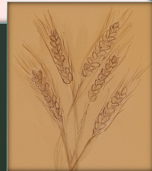
Possible details for motif on face of seat