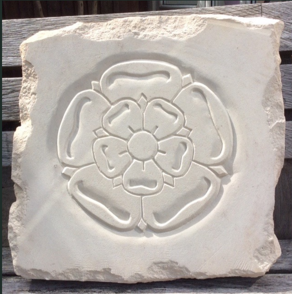
Yorkshire Rose – commissioned for hotel in Anagni, Italy